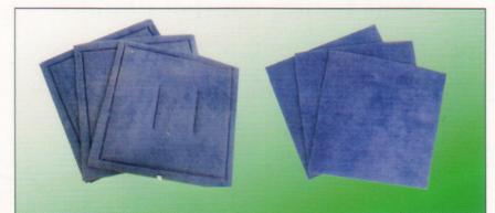
Pad & Ring Filters