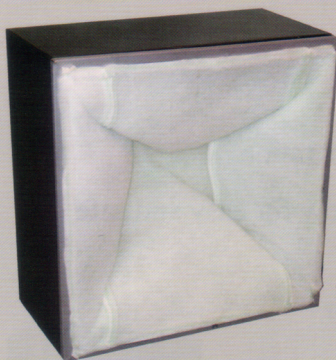
General Purpose Filter