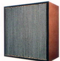
Replacement Hepa Filter